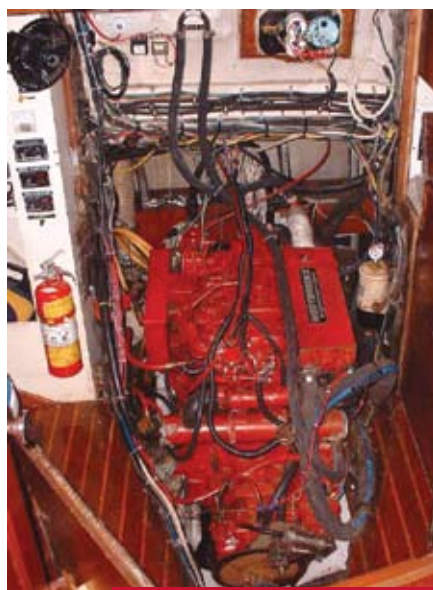
From the top: lowering the compressor; the old engine bed; the old engine before the fuel polishing system

The alarms of the gauge panel were wired into the existing ship’s alarm panel. A few wires were added to connect the external alternator regulator and engine-driven refrigeration compressor clutch. After that,