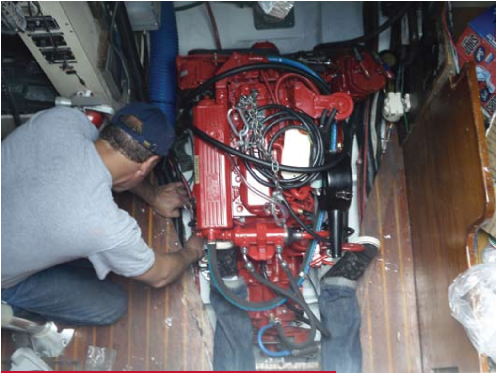
This page, lowering and positioning the shiny new engine. A chain hoist for minute control makes life so much easier!

break, as the rear wheels of the tractor lift off the ground first. And without a massive counterweight, we found they did just that when we first tried to remove the heavier old engine.)