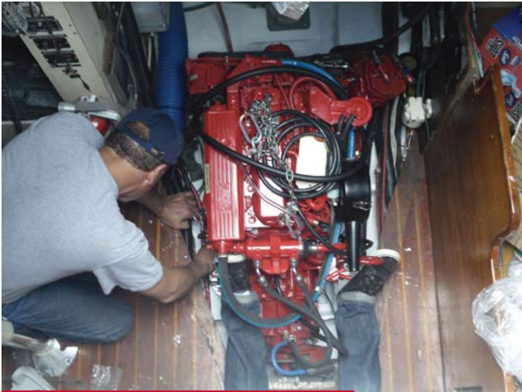
This page, lowering and positioning the shiny new engine. A chain hoist for minute control makes life so much easier!

break, as the rear wheels of the tractor lift off the ground first. And without a massive counterweight, we found they did just that when we first tried to remove the heavier old engine.)